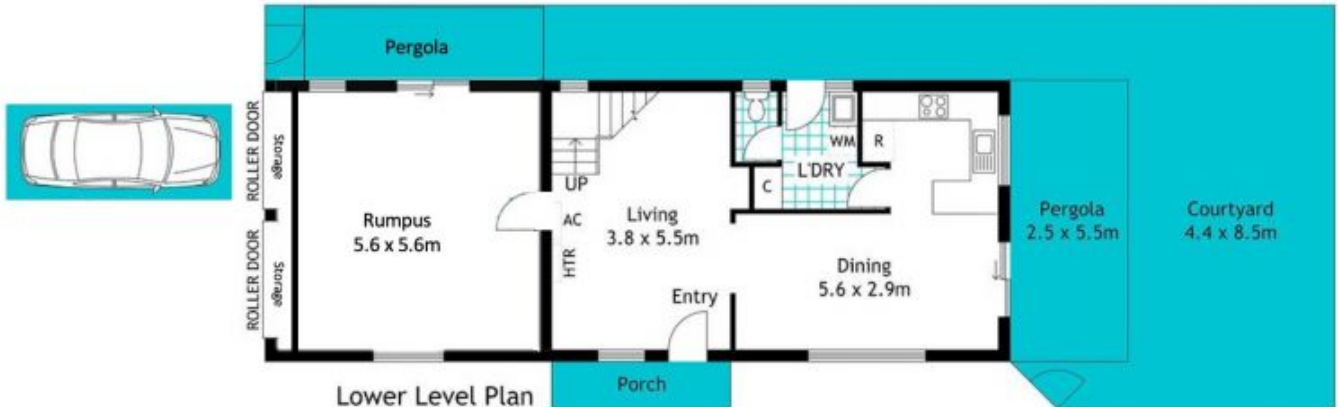
Lower Level Plan