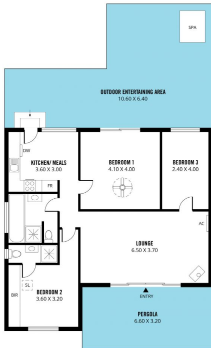
HOUSE #1 (FRONT)