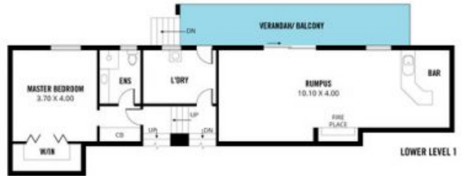
LOWER LEVEL 1