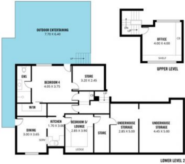
LOWER LEVEL 2