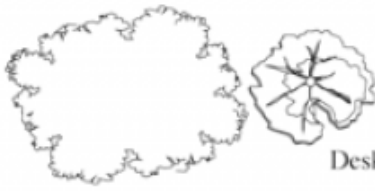
Desk Top Image (V0411-70)