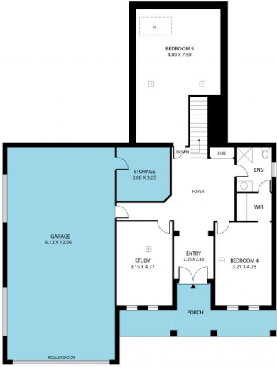
UPPER GROUND LEVEL