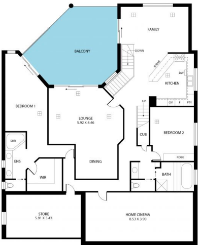
MIDDLE GROUND LEVEL