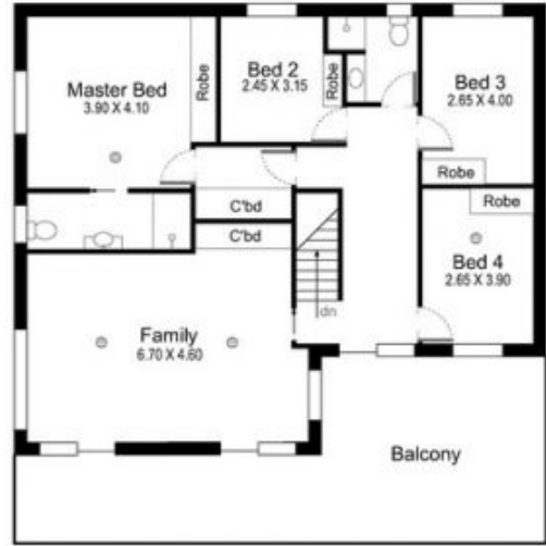
Figure intended as a reference only. Any specific measurements required should be obtained by an independent surveyor.