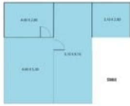
NET IN LOCATION