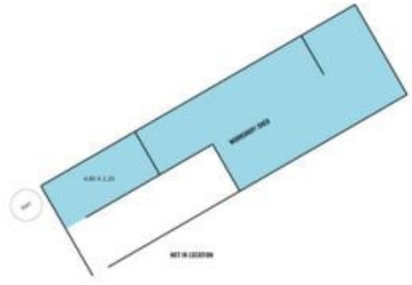
NET IN LOCATION