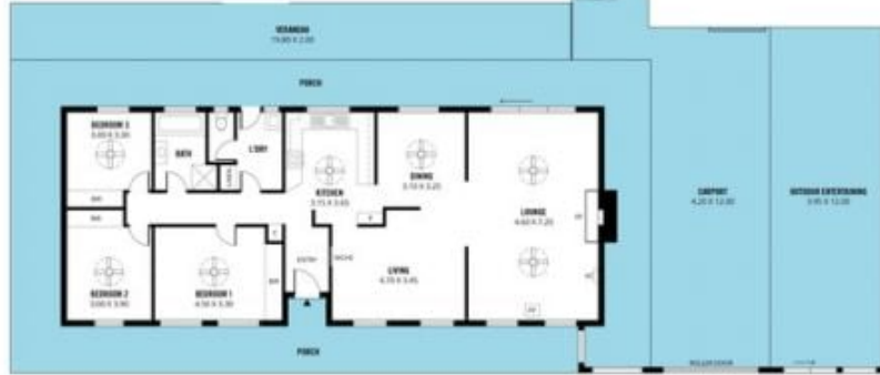
CARPORT 4.20 x 12.00 NET IN LOCATION