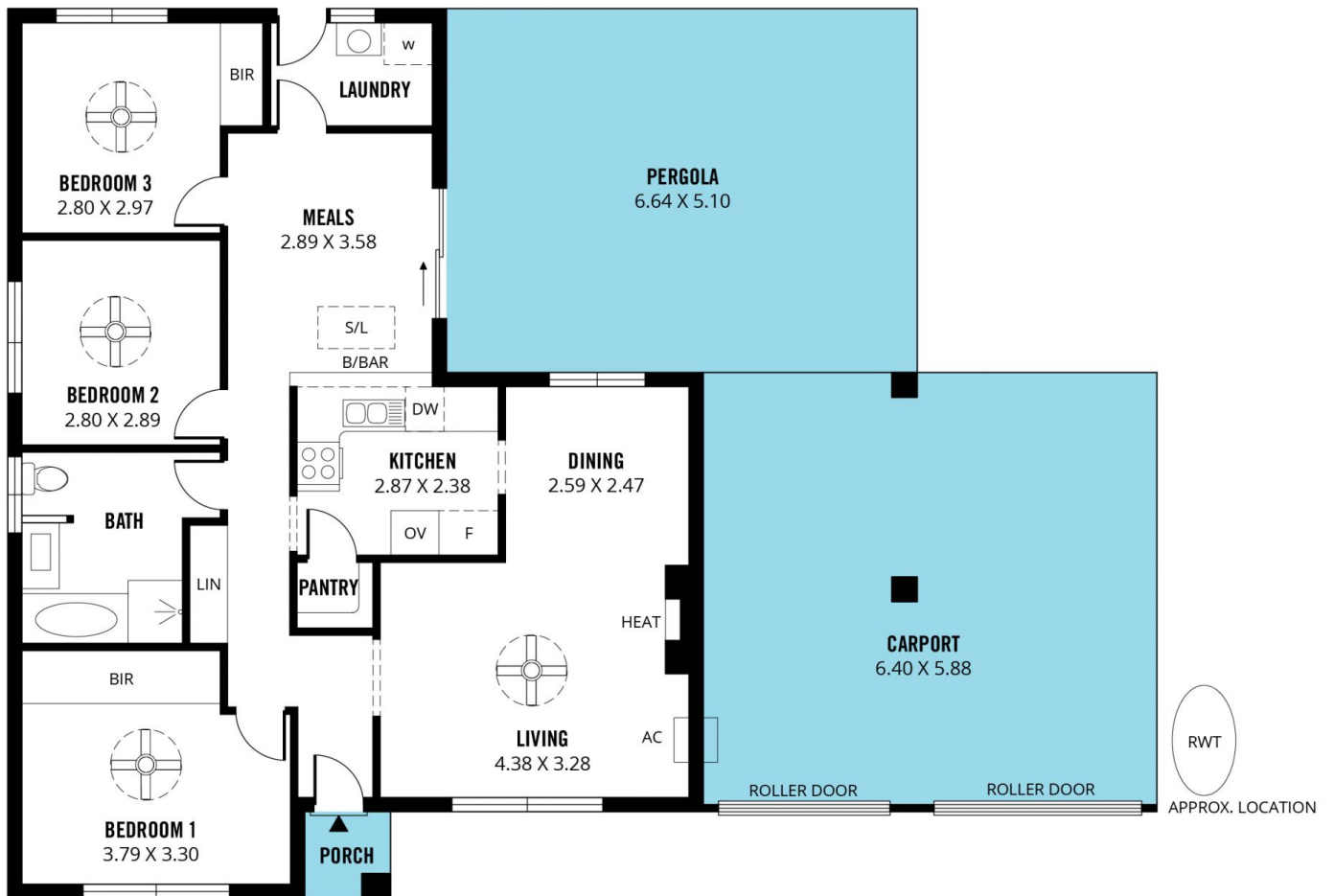
RWT APPROX. LOCATION