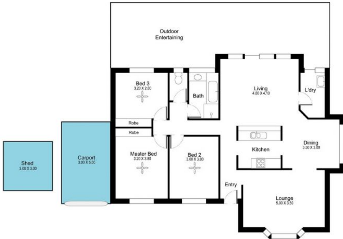
Figure intended as a reference only. Any specific measurements required should be obtained by an independent surveyor.