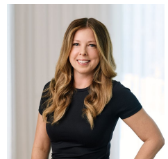
Zoe Ball 08 8381 6000