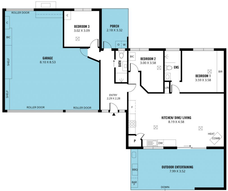
HOUSE #2 (BACK)