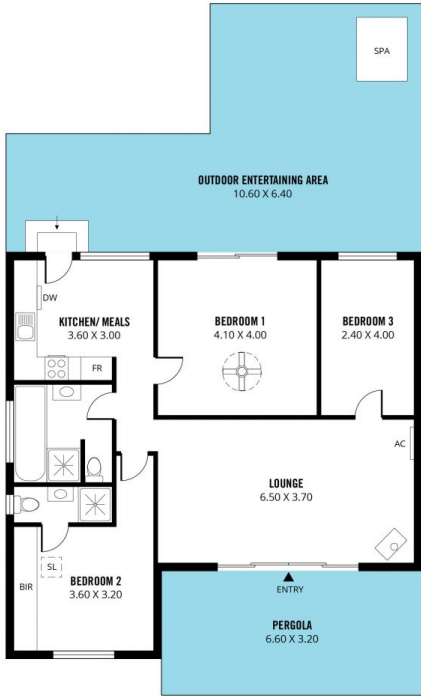
HOUSE #1 (FRONT)