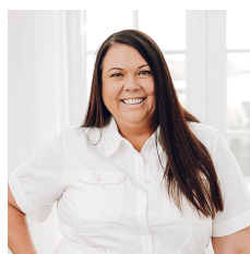
Kylie De Palma 82771777

> Perched on the 8th floor of the iconic Saltram Towers, this exceptional apartment offers the ultimate Glenelg beachfront lifestyle. With panoramic ocean, city, and hill views, three oversized bedrooms, and a wrap-around balcony, this is coastal living at its finest > Step inside via a generous entrance foyer and take one of two lifts up to level 8. For added peace of mind, your two allocated basement car parks are fully secure, protecting your vehicles from the salty sea air. Upon arrival, you'll find