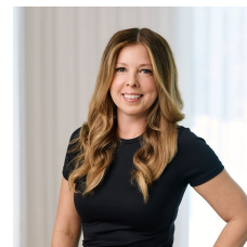
Zoe Ball 08 8381 6000